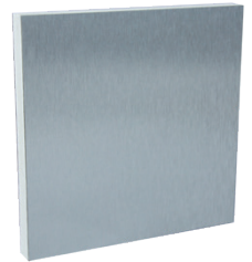
PVC Panel Brushed Aluminium